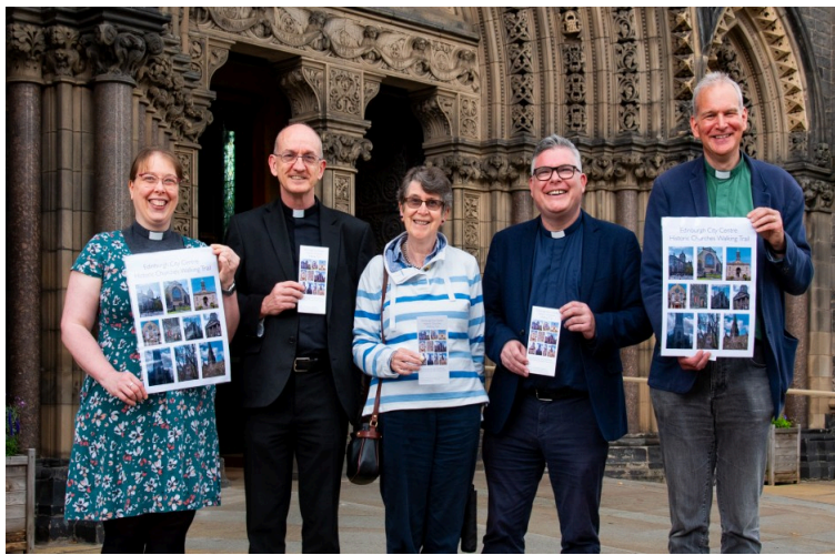
(Outside St Mary's Episcopal Cathedral.)

Ten of the city's architectural jewels and spiritual havens feature in the Edinburgh City Centre Historic Churches Walking Trail, which leads from the Royal Mile to the New Town and the West End.